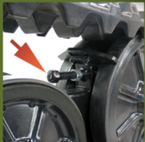
Simple track tensioning system designed for easy access.

The increased flotation that our trailer kits provide will allow you to enter your fields when you need to and get the job done without having to worry about harsh ground conditions. Our sprayer track kit becomes the equipment of choice for efficient spraying all while minimizing the imprint left on your fields.