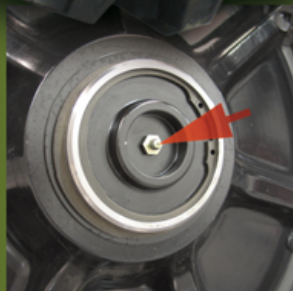
Grease lubricated wheel axles for enhanced longevity.