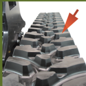
Rubber track profile designed for increased flotation and high load applications.